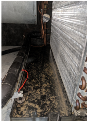
HVAC unit condensate drain pan full of debris

Change the thermostat fan setting to the “on” position during occupied periods. The fan running “on” will reduce the stratification of the warmest air rising to the roof/ceiling and reduce the duct sweating. The fan setting in the “auto” position turns the fan on only when the unit’s cooling compressor is running.