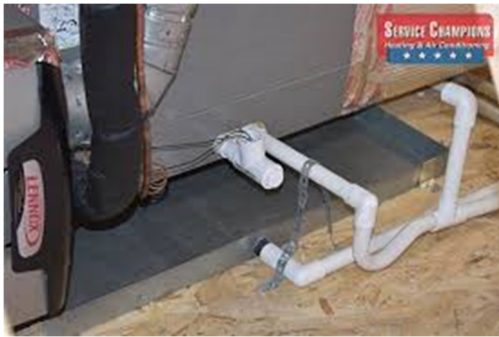
HVAC unit condensate drain line ( servicechampions.com/how-does-condensate-drain-pan-work/ )

4 Check the rooftop HVAC unit’s setting for the outside air intake damper. If the outside air quantity is set too high, more humid air is introduced into the space which can cause the sweating ductwork. If the HVAC unit is equipped with an economizer, ask yourself if the outside air and relief air dampers are operating correctly.