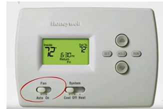
Thermostat fan switch in “auto” position

to the temperature extremes and the hot humid air rising to the roof/ceiling. https://files.nc.gov/ncdeq/Environmental%20Assistance%20and%20Customer%20Service/IAS%20Energy%20Efficiency/Opportunities/Setback_Temperature_Control.pdf