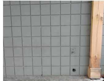
Exterior painted concrete masonry block

12 The exterior Concrete Masonry Unit (CMU) walls were originally painted with air barrier/epoxy, but it was not applied at a thickness great enough to seal the CMU. The exterior was repainted, but the window sills are still showing signs of water intrusion. If the CMU is still “leaking”, then the HVAC system might never be able to de-humidify the space correctly.