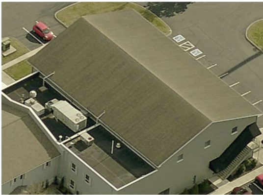
Ballroom building with adjacent flat roof addition

Summer heat is upon us and your air conditioning system should get a check-up. Many in the building design and construction industry have observed sweating ducts, but some of the reasons are not always evident. The colder the air temperature in the ducts, the greater the chance of sweating ductwork. This is similar to the manner an ice-cold drink glass sweats in the summertime. Most of us use coasters to prevent water damage to the furniture. The cold drink is similar to the cold air in the duct and the drink glass surface is analogous to the metal ductwork surface.