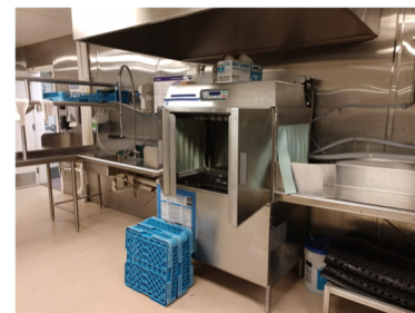
Dishwasher with large condensate removal

9 If the cooking rangehood switches have separate exhaust and supply fan switches, re-work them so that one switch turns on both fans. Connecting the two switches will result in a better air balanced (not negative air balance) building and less ductwork sweating.