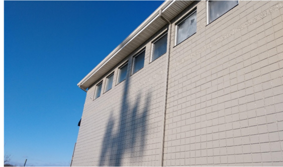
Windows showing signs of moisture damage

sills indicating signs of moisture intrusion. The building was built in several phases and started life as a church, which was expanded several times. Our recommendations are listed below in order of complexity: