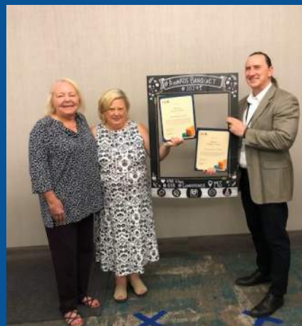
Showing off Chattanooga Awards