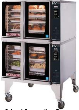
School Convection Oven

What is one food that most of us will always eat, even if we are on a diet? If you answered pizza, that is one food that can be