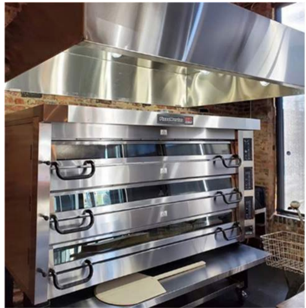
Deck Pizza Oven with Type I Hood /w Pizza Peel Tool

If you want to learn more about the design and construction process, join us at the CSI Chattanooga chapter meetings . Meeting details are on our website at chattanoogaacci.org .