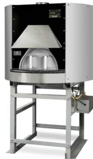
Brick/Iron Dome Pizza Oven

https://www.forzapizza.com/blog/pizzamaster-faq